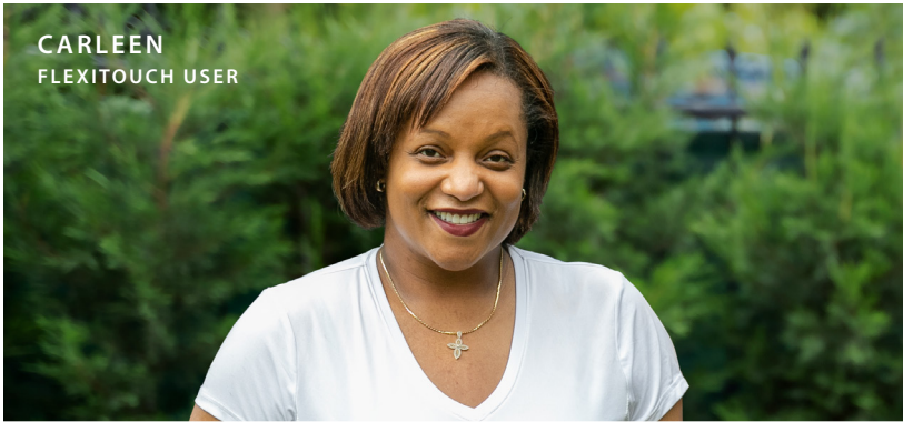
CARLEEN FLEXITOUCH USER