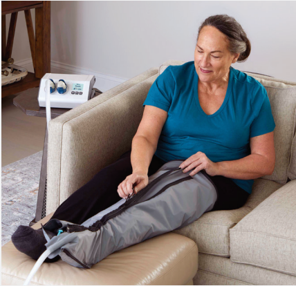
ENTRE® PLUS Basic PCD for arms or legs.

You can self-manage your condition and experience everyday joys again.