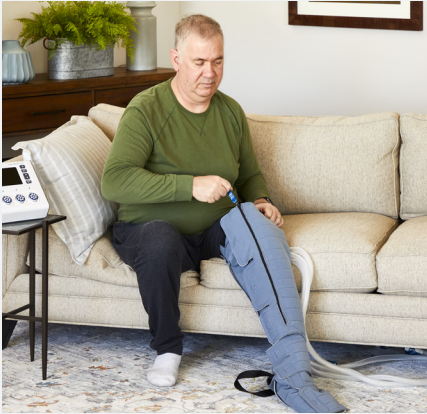
FLEXITOUCH® PLUS Advanced PCD for arms, legs, or head and neck.