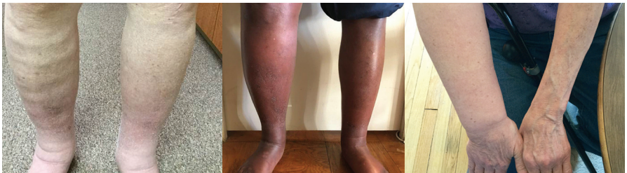
PATIENTS SUFFERING FROM LYMPHEDEMA