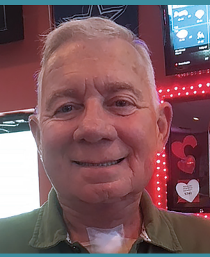
AFTER EIGHT MONTHS