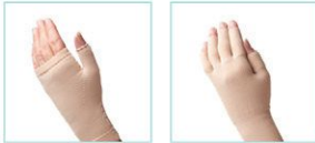
Gloves & Gauntlet available separately