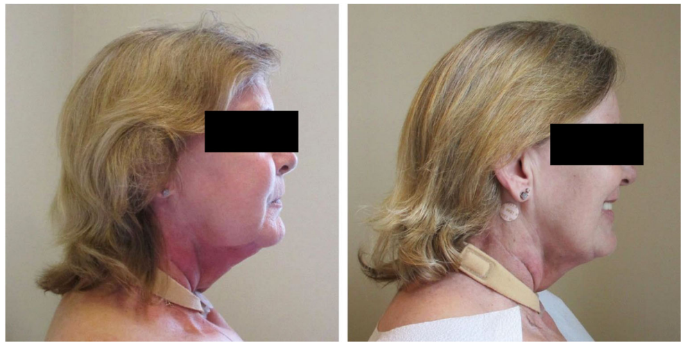
Fig. 2 An exemplar intervention subject before randomization and after last 8-week treatment (left to right)

regarding their ability to control their lymphedema, potentially reducing patient distress. Empowering patients to manage their lymphedema and its associated symptoms may also result in long-term cost savings by decreasing the need for professional therapy sessions and mitigating long-term adverse effects.